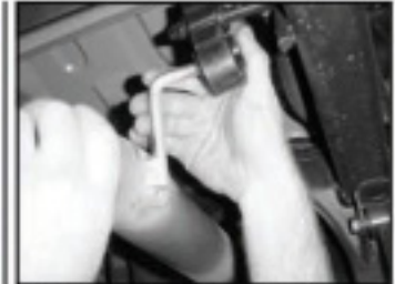
18. Install tail pipe hanger into the lower hole of the factory rubber isolator.