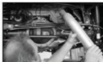
6. Remove tail pipe assembly from rear of vehicle.