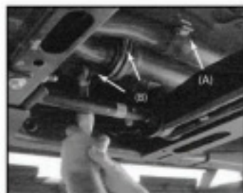
7. Using 15mm socket, loosen nut on clamp (A) and remove nuts from flange (B).