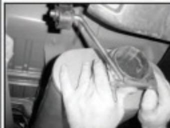
14. Install muffler hanger/clamp (D) at the rear of the muffler. Support the muffler to allow clamp to index flat on the bottom.