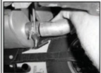
19. Insert tail pipe (C) into muffler (B).