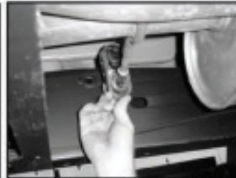
8. Remove muffler hanger from rubber isolator.