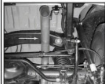
20. Align tail pipe with notch in frame (arrow) so the tip is aligned flat across the rear bumper. Tighten muffler hanger-clamp (D) at the rear of the muffler to secure tail pipe (C).