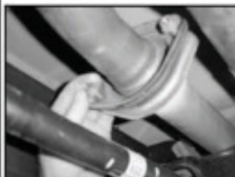
12. Install nuts and washers onto intermediate pipe (A) flange.