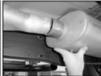
13. Slip muffler (B) onto intermediate pipe (A).