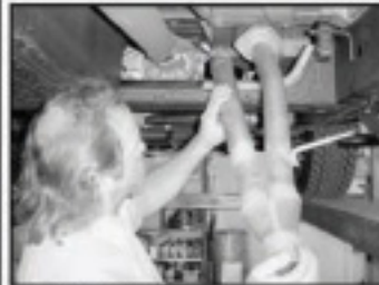
9. Remove muffler assembly.