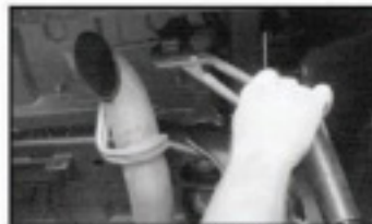
5. Remove tail pipe from rear hanger.