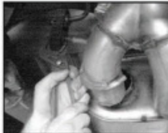
4. Using a pair of channel lock pliers or rubber hanger tool, remove hanger rods from bottom hole of tail pipe rubber isolator.