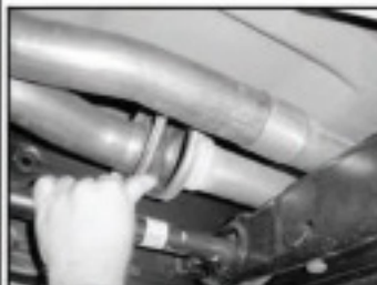
10. Install new intermediate pipe (A). Slide new intermediate pipe over factory down pipe, align flange bolts.