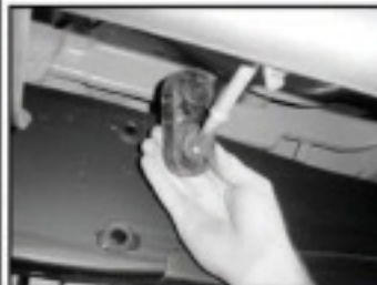
11. Insert intermediate pipe hanger.