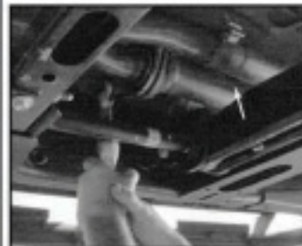
16. Install and tighten band clamp (F) (arrow) over slip tube at the front of the new intermediate pipe (A).