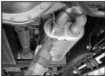
3. With the vehicle raised and properly supported, cut the tailpipe behind the muffler, in front of the hanger.