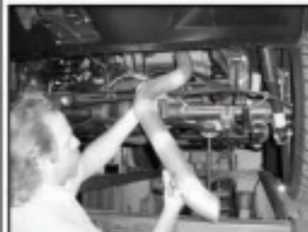
17. Install new tail pipe