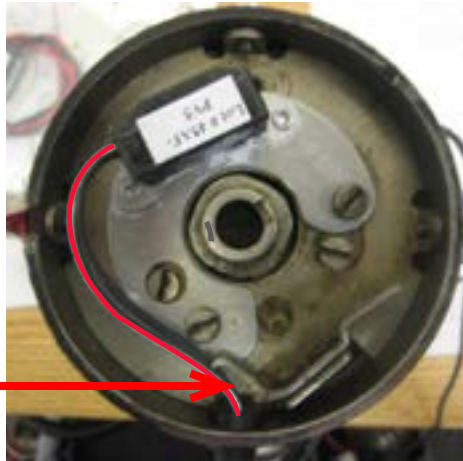
Picture of 2181 Note: 2181 and 2182 are installed in the same manner.

Using a pair of pliers, bend the original bracket to provide clearance for the wire grommet.