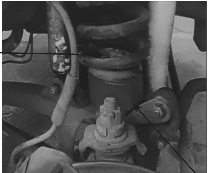
Spring spacer installed - note flat section face forwards

N.B: It is recommended that a licenced workshop or tradesperson carry out the above procedure and that workshop manual and relevant safety procedures are followed in addition to the above.