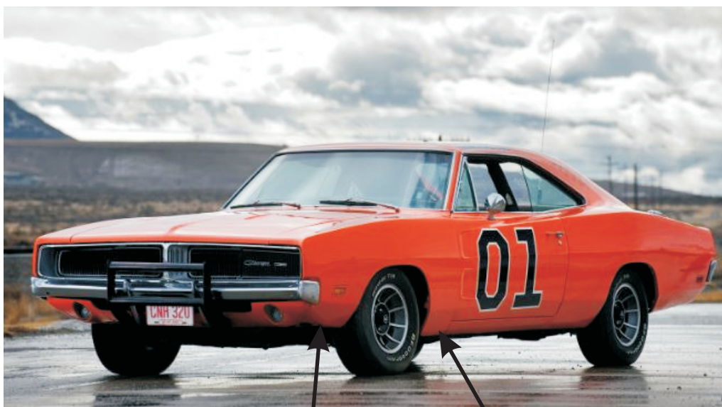
Sub-frame - Position #1