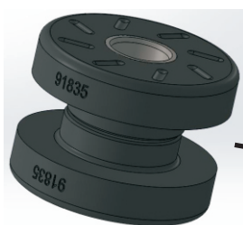
Bushings 91835 + steel tubes