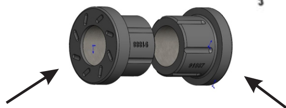
Bushing 91888 - front