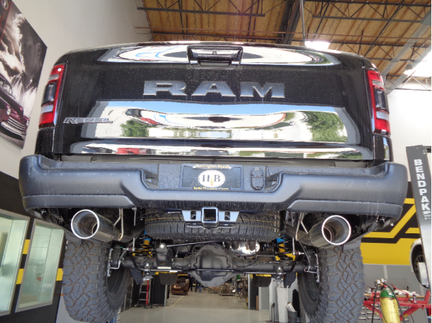
Step 7: Using the supplied rubber insulators install the tailpipe assemblies to the mid pipes fitting the hangers into the installed hanger brackets.