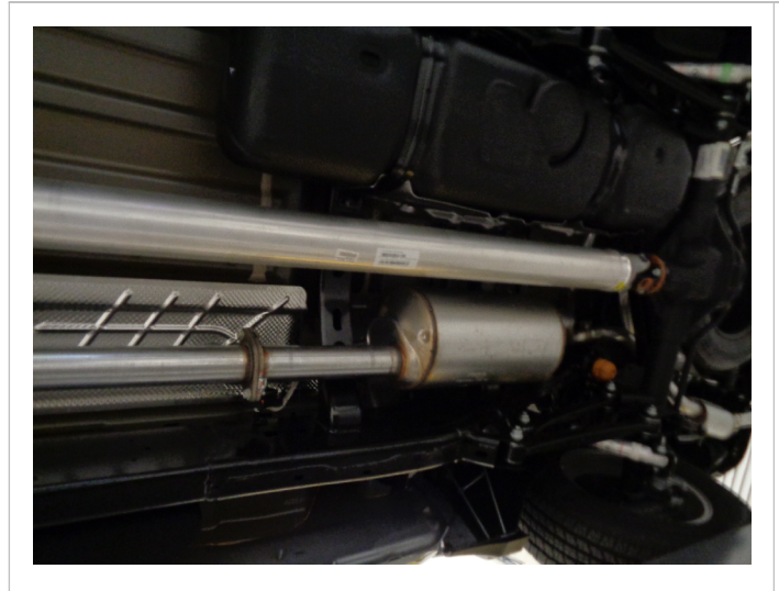
Step 1: To remove the OEM exhaust system, loosen hardware at the muffler flange.