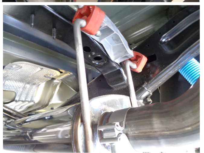
Step 4: Locate the welded hangers to the rubber insulators. Leave all clamps loose for final adjustment of the complete syste once installed.

MAGNAFLOW: 1901 Corporate Centre Dr - Oceanside, CA 92056 | 1(800)990-0905 Technical Support: 1(800) 959-9226 | Email: moreinfo@magnaflow.com