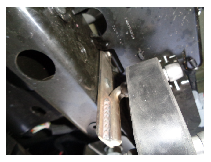
Step 6: On the driver side attach the bracket assembly with the bolts and washers provided.