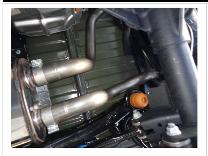
Step 5: Next, attach the driver side and passenger side mid pipes to the mufflere and loosely tighten.