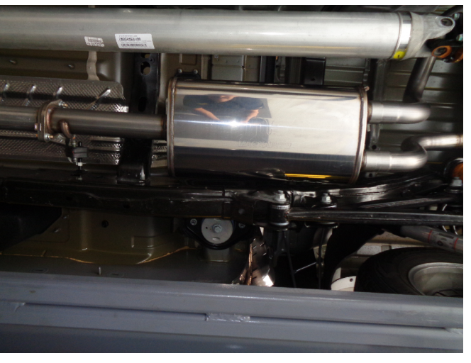
Step 3: Install the new system by attaching the muffler assembly to the resonator pipe assembly with supplied hardware and gasket.