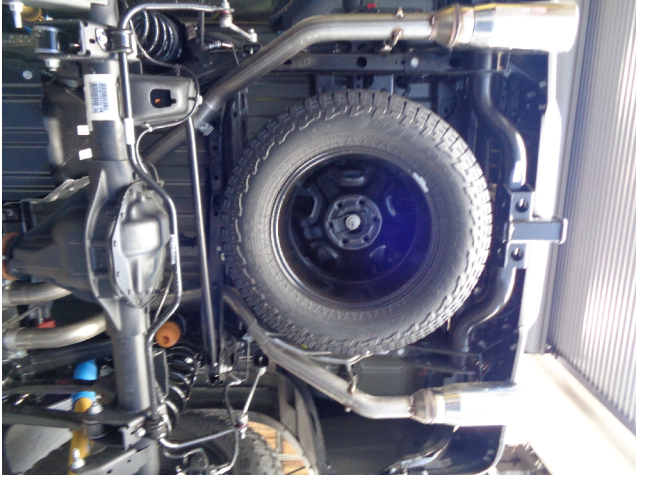
Step 8: Once a final position has been chosen for the new exhaust system, evenly tighten all clamps from front to rear using the torque specifications on page one of the instructions. Inspect all fasteners after 25-50 miles of operation and re-tighten if necessary.

MAGNAFLOW: 1901 Corporate Centre Dr - Oceanside, CA 92056 | 1(800)990-0905 Technical Support: 1(800) 959-9226 | Email: moreinfo@magnaflow.com