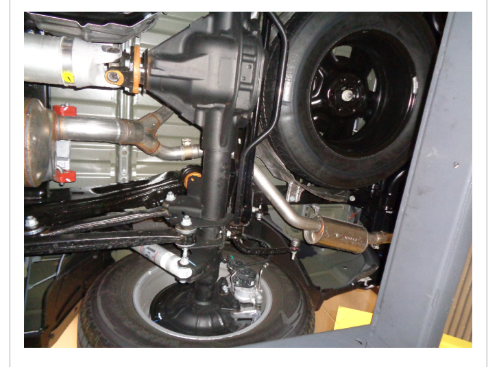
Step 2: Working front to rear disengage all welded hangers from the rubber insulators and remove the system. (Retain the insulators as they will be needed to mount the new MAGNAFLOW system.)