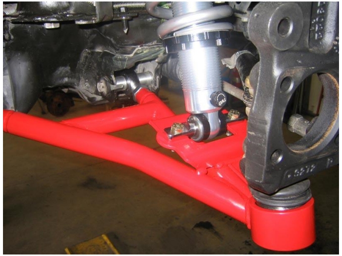
Image 3- Lower A-Arm with shock installed.